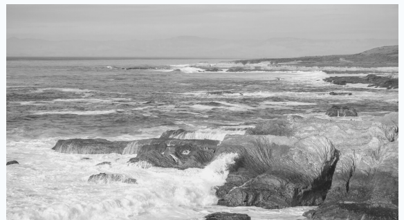
San Luis Obispo County is 3,300 square miles