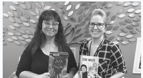
Delivering books to the Shandon Library; Driving the Branch Out library van in South County; Staff Picks at the Atascadero Library