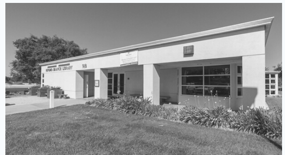
SLO Library, Cayucos Library, Nipomo Library