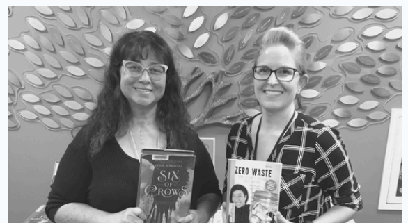
Delivering books to the Shandon Library; Driving the Branch Out library van in South County; Staff Picks at the Atascadero Library