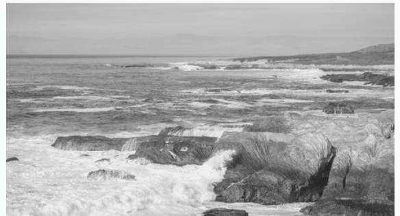
San Luis Obispo County is 3,300 square miles